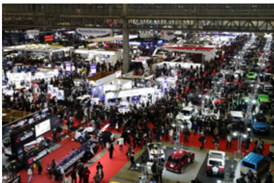
Previously held TOKYO AUTO SALON 2020

Visitors and staff members safety is always top priority of TAS. We are committed to providing even safer and richer event in a new style while exerting every possible effort to take proper measures to prevent infection.