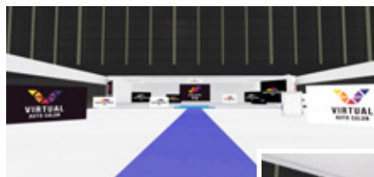
Virtual AUTO SALON (draft image for illustrative purposes only)